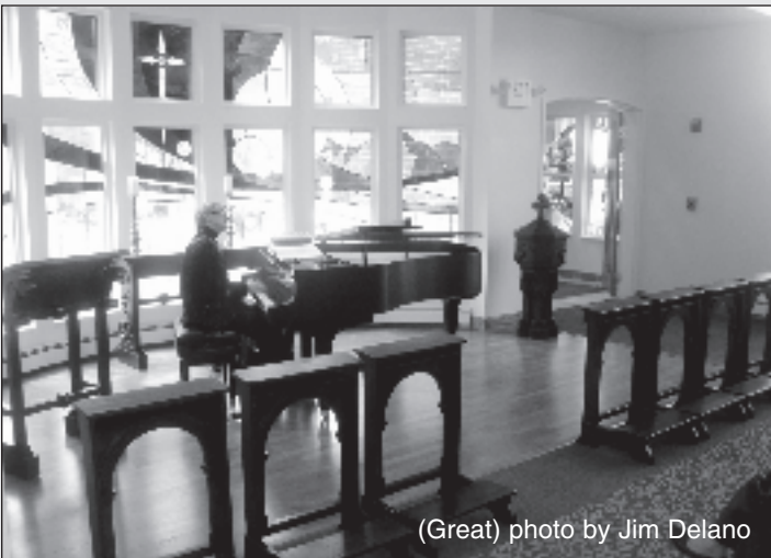
(Great) photo by Jim Delano

The opening of Cornelia House and Coventry Chapel in April 2005 fulfilled two of the four goals set for our Celebrate the Journey capital campaign. Cornelia House has brought 47 units of much-needed affordable senior housing to our neighborhood. It is also bringing our campus community together as never before with enclosed links to Seabury and Episcopal Church Home. Now, all of our residences are connected. On October 17, Bishop Jelinek will dedicate Coventry Chapel and its steeple will be crowned with a cross.